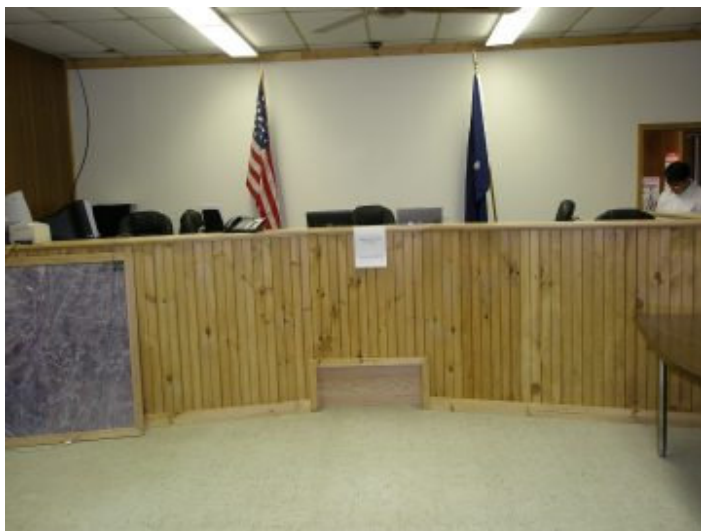
Top-Picture of the new sign at the Ostrander Cemetery